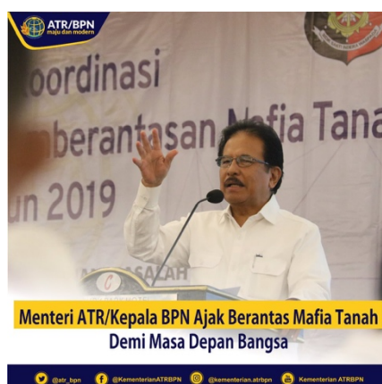
Figure 3. Twitter Post from Indonesian Ministry of Agrarian Affairs and Spatial Planning Official Account on November 20, 2019

At the central level the Ministry of Agrarian Affairs and Spatial Planning/National Land Agency has a Memorandum of Understanding (MoU) with the National Police of Indonesia and The State Attorney's Office of the Republic of Indonesia, which is also followed up with a federal cooperation agreement. Because there have been issues so far about the settlement of conflicts concerning government assets, because there are reservations both on the part of the ministry and government agencies, for fear of being seen as losing state assets. And there is still a lack of awareness of the Community's value in handling certificates. Provision of awareness to the people of Indonesia in connection with the handling of land cases for socialization to be a solution relevant to the handling of conflict cases and land disputes is carried out.