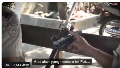
Figure 2. Twitter Post from Indonesian Ministry of Agrarian Affairs and Spatial Planning Official Account on November 15, 2019