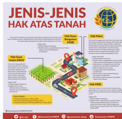
Figure 1. Twitter Post from Indonesian Ministry of Agrarian Affairs and Spatial Planning Official Account on February 20, 2019

Throughout Indonesian society there are still many lands which do not have legal titles or certificates yet. This program must therefore be implemented in order to avoid problems in different sectors, in particular in the economic sector. It was stated that in 2018 the government had distributed 7 million land certificates as targeted. The realization of the distribution of land certificates can certainly achieve the target because of the strong push. This is inseparable from the rules that are changed, such as updated technology. So that the bureaucracy in the agrarian ministry is getting better.