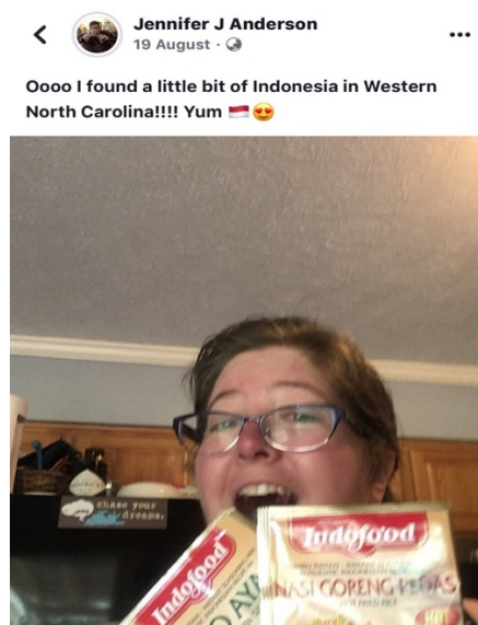
Figure 3. A Social Media Post from an ASU Lecturer