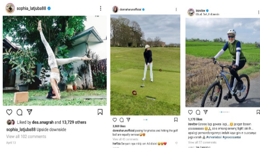
Figure 1. Senior female celebrities and their choice of sport

Sport is one of the prominent themes in the three accounts because they have their preferences for sporting activities and do it regularly. For example, Sophia Latjuba pursues yoga, and Donna Harun chooses golf, while Ira Wibowo enjoys walking, cycling, and hiking. Self-representation as a sports lover can be seen from the description or account profile, then continues to the photos, captions, and hashtags used in the posts. Sophia Latjuba, for example, wrote " Mom-Creator-Yogini-RYT200 " in her account description (@sophia_latjuba88, 2021). The word "Yogini" itself is a special term for women who are yoga practitioners or yoga adherents. This shows a close relationship between Sophia Latjuba and yoga, where it can be said that yoga has become the identity of her life. Here are some posts showing each celebrity's choice of sports activities (Figure 1):