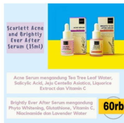
Figure 2. Instagram posts with Scarlett ads (1)

The five indicators that were coded were 1) advertising, 2) sales promotion, 3) public relations and publicity, 4) personal selling, and 5) direct marketing. The #scarlettlakilaki in Instagram posts are dominated by advertising signs.