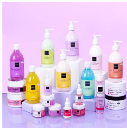
Figure 1. Scarlett product

Furthermore, brand image and trust have substantially impacted purchase intent (Sanny et al., 2020). Normative Influences and Attitudes for Applying Skincare are two factors that influence the behaviour of men consumers purchasing skincare goods in Suwon, South Korea. Beliefs in Product Aspects, Self-Image Aspects, and Aging Effects are among the elements that influence men's purchasing behaviour in Bandung, Indonesia (Ridwan et al., 2017); one of the skincare products is Scarlett.