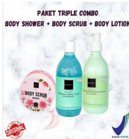
Figure 3. Instagram posts with Scarlett ads (2)

Lavender Water helps soothe troubled skin and acts as an anti-inflammatory.