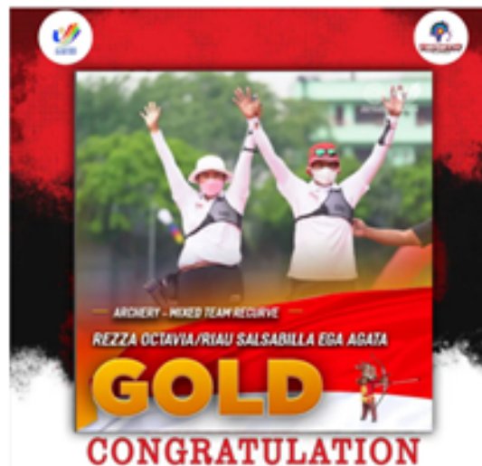
Figure 2. Instagram post @vienetharcheryofficial 18 May 2022

Furthermore, the coding results were based on five indicators: advertising, sales promotion, public relations and publicity, personal selling, and direct marketing. It is known that most of @vienetharcheryofficial Instagram posts display public relations and publicity indicators.