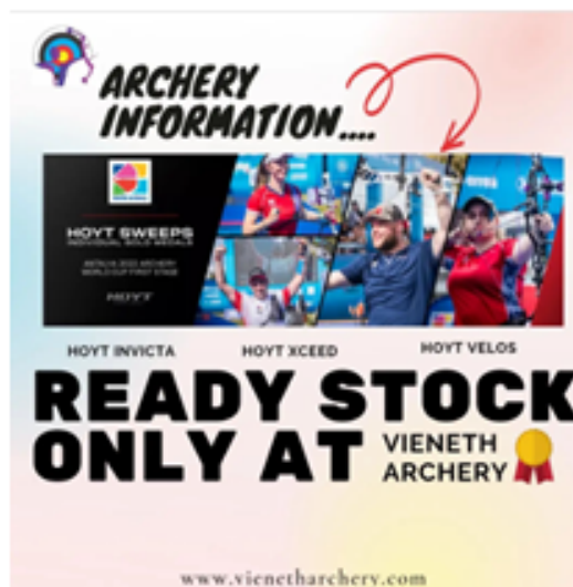
Figure 4. Instagram post @vienetharcheryofficial 25 May 2022 Source: (Instagram, 2022b)