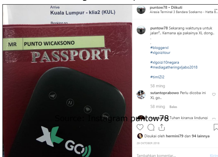
Figure 2. Passport