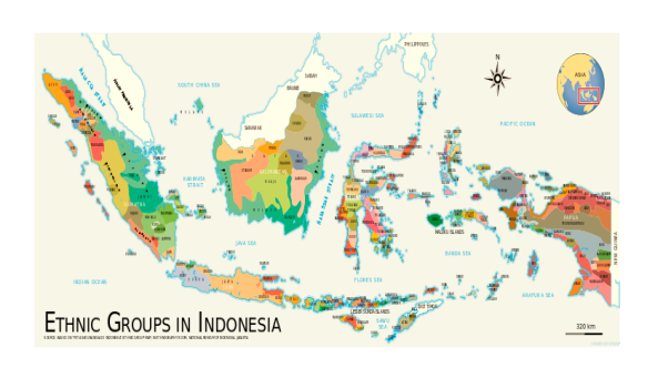
Figure 3. Several major ethno-linguistic groups of Indonesia (Kuoni,1999)

The proportional population of Pribumi according Kuoni (1999) based the census 2009 is influenced by location and geography. The matter is every location has their own local wisdom to relocate communication. It is true that communication plays a major role in bridging differences in order to have similar understanding about something. In addition. through communication. unresolved many problems can be discussed overcome. Those conditions are also applied to the case of the gap between Ethnic Minorities and government. However, what kind of communication that will bring the Ethnic Minorities and government come together and work hand in hand to preserve and develop the precious culture that might become extinct?