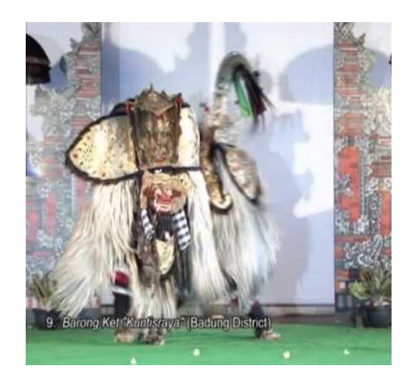
Figure 1. Barong - Balinese Dance (Directorate of Internalization of Value and Cultural Diplomacy, 2014)

to its uniqueness, dances can be an identity of a particular ethnic group and people can learn more about that ethnic group through its dances.