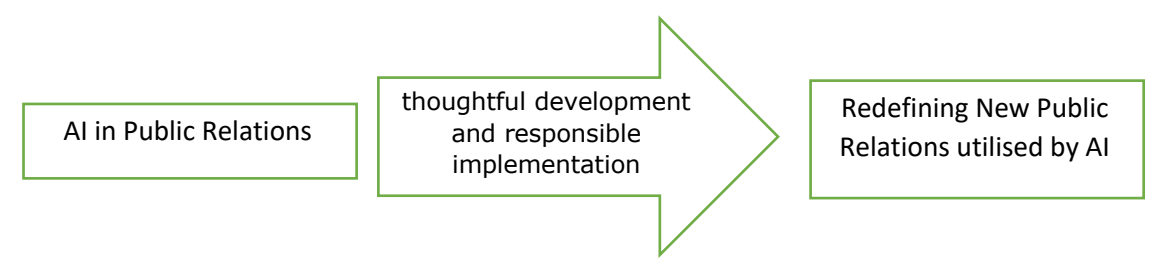
Figure 1. Future AI Implemented on Public Relations Activities

The future of AI holds immense promise and potential. AI can revolutionise various industries and transform our lives, from healthcare and transportation to education and entertainment. However, addressing ethical concerns, ensuring transparency, and upholding human values are essential to harness AI's potential while minimising potential risks. With thoughtful development and responsible implementation, AI can become a powerful tool to augment human capabilities and drive progress in the years to come (See Figure 1).