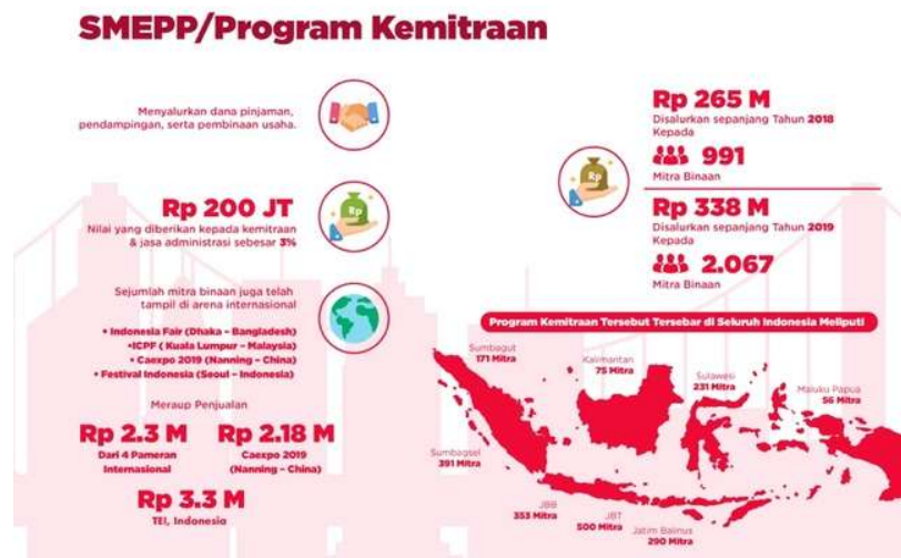
Figure 1. Small Medium Enterprise Partnership Program Infographic