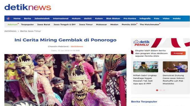
Figure 2. Media coverage of Gemblak Ponorogo

The first news article titled "This is Gemblak's Leaning Story in Ponorogo," was published by DetikNews on 13 January 2018 (Figure 2).