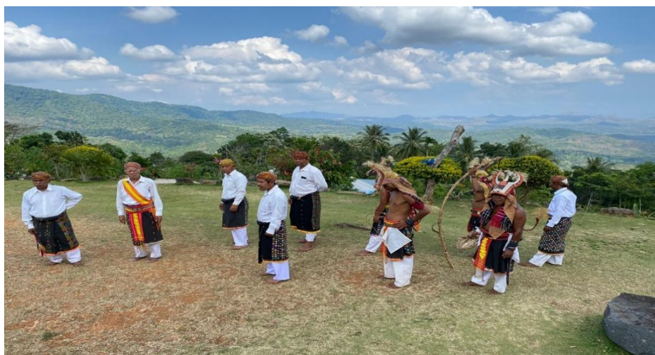
Figure 1. Preparation of Caci Dance Performance

One of the dance performance arts that can be used to convey messages and also to strengthen cultural identity is the Caci dance. This dance originates from Manggarai Regency, East Nusa Tenggara, and is also one of the dances that is often performed in front of tourists, both international and domestic, who visit the Labuan Bajo tourist destination. The dance, unlike other dances in Indonesia, does not only show beauty and aesthetics, but also shows scenes of violence.