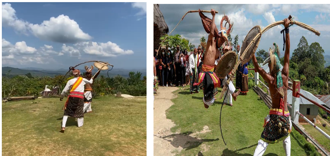
Figure 3. The two groups fight in several rounds in the Caci Dance Performance Art

The main equipment is Larik, which is similar to a whip used by the attacking group, while Toda is a round shield used by the defending group to protect and also Koret, a parrying stick in a semicircular shape resembling a crescent moon (Karolus, personal communication, 16 September 2024).