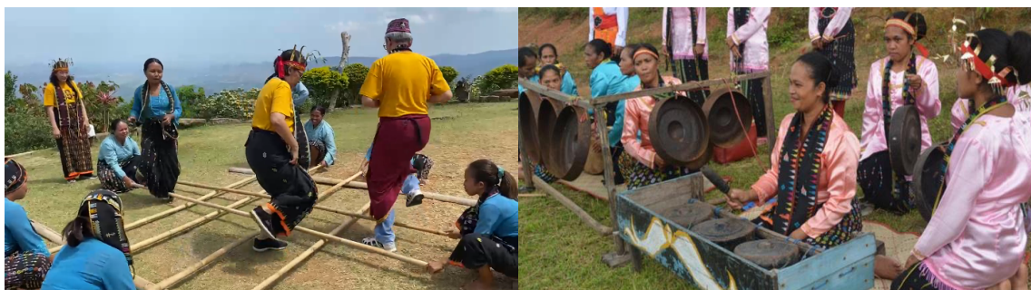
Figure 4. A combination of movement arts displayed through fighting, accompanied by traditional music, in the Caci Dance performed by the Manggarai Society.

These three main equipments are primarily used in the fight in the Caci dance. The two groups fight in several rounds and take turns as the attacking and defending groups (See Figure 3). Every fighter who plays the Caci dance is an adult (over 21 years old), has a good physique and experience. The rules of the fight are: only striking above the waist (it is prohibited to attack below the waist), the attacking group is only allowed to attack/hit once using a whip (larik) and if it hits the opponent's waist and above, the fighter is declared the winner and the wound obtained due to the whip is considered as a symbol of masculinity. The defending group tries to use a round shield (toda) and a parrying shield (koret). The combat is accompanied by songs from traditional musical instruments played by women.