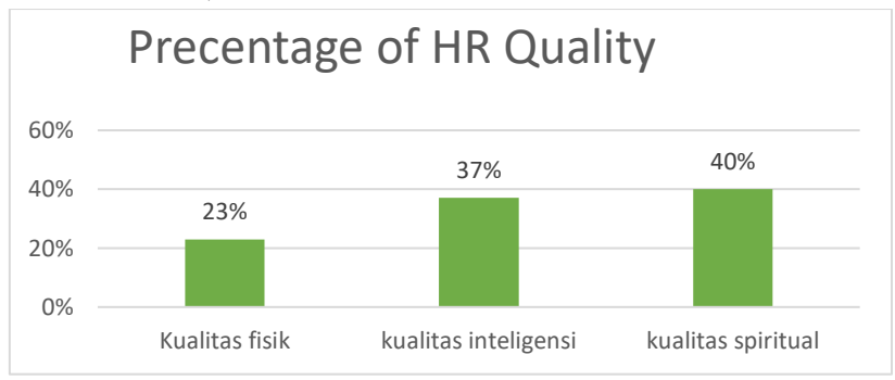
Figure 2.1; The quality of human resources for the people of Giri Gresik Village

Based on the results of primary data processing, namely about the quality of human resources, the Giri Village community, from 100 respondents the results obtained as shown in Figure 2.1 as follows;